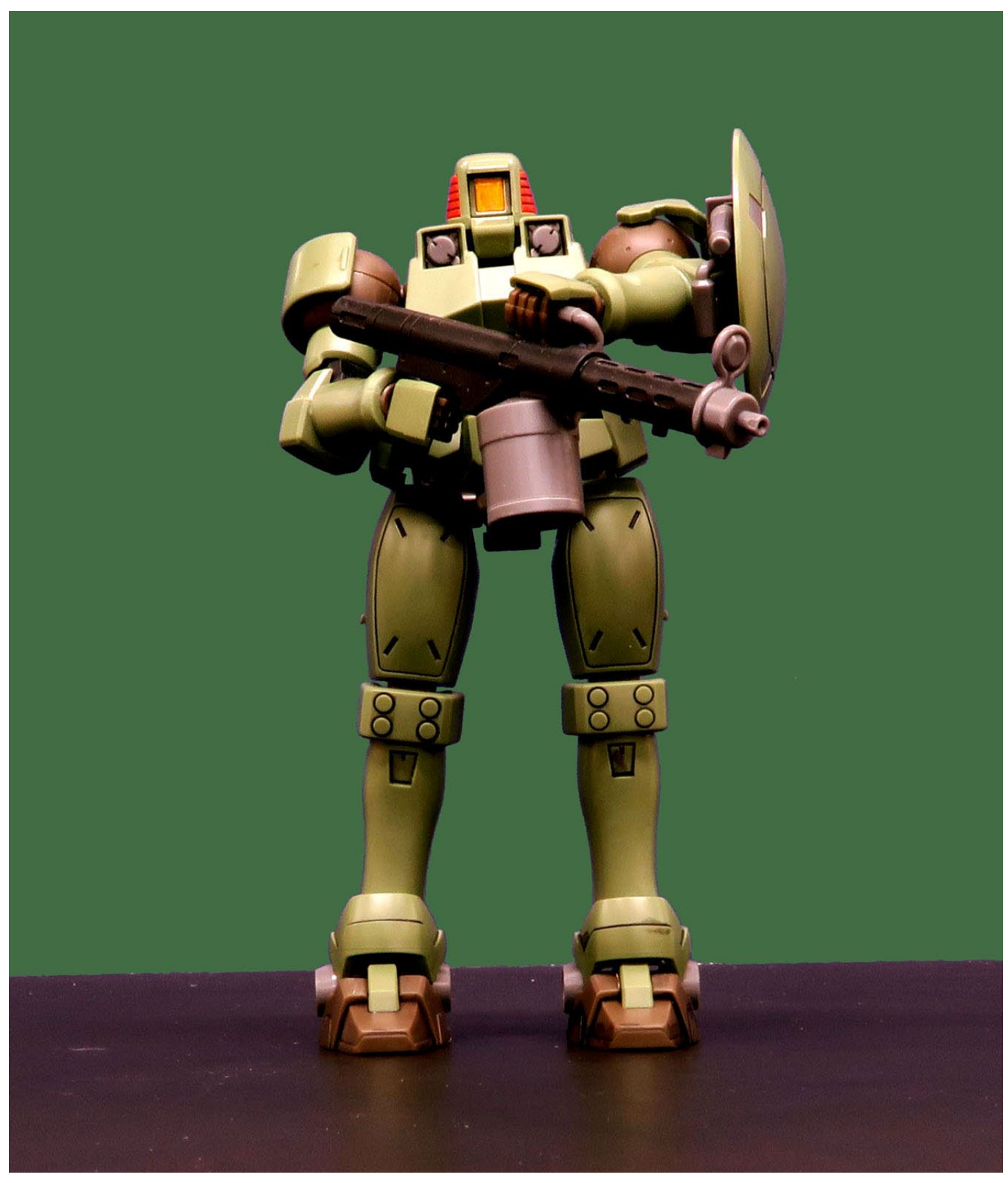
Lars Knowles's 1:144 scale OZ-06MS Leo (Bandai). The Leo is a mass-produced, general purpose mobile suit in the After Colony timeline. The unit is featured in Mobile Suit Gundam Wing . When the OZ-00MS Tallgeese mobile suit prototype proved too expensive and unfeasible for most pilots to handle, the design was downgraded into a simpler, less-powerful unit. Naming their mobile suits after signs of the Zodiac, OZ's first mass-produced unit was called the OZ-06MS Leo. The Leo would serve as the mainstay of the mobile suit forces for the Earth Alliance military, the Specials force, and later OZ and its Romefeller Foundation masters.