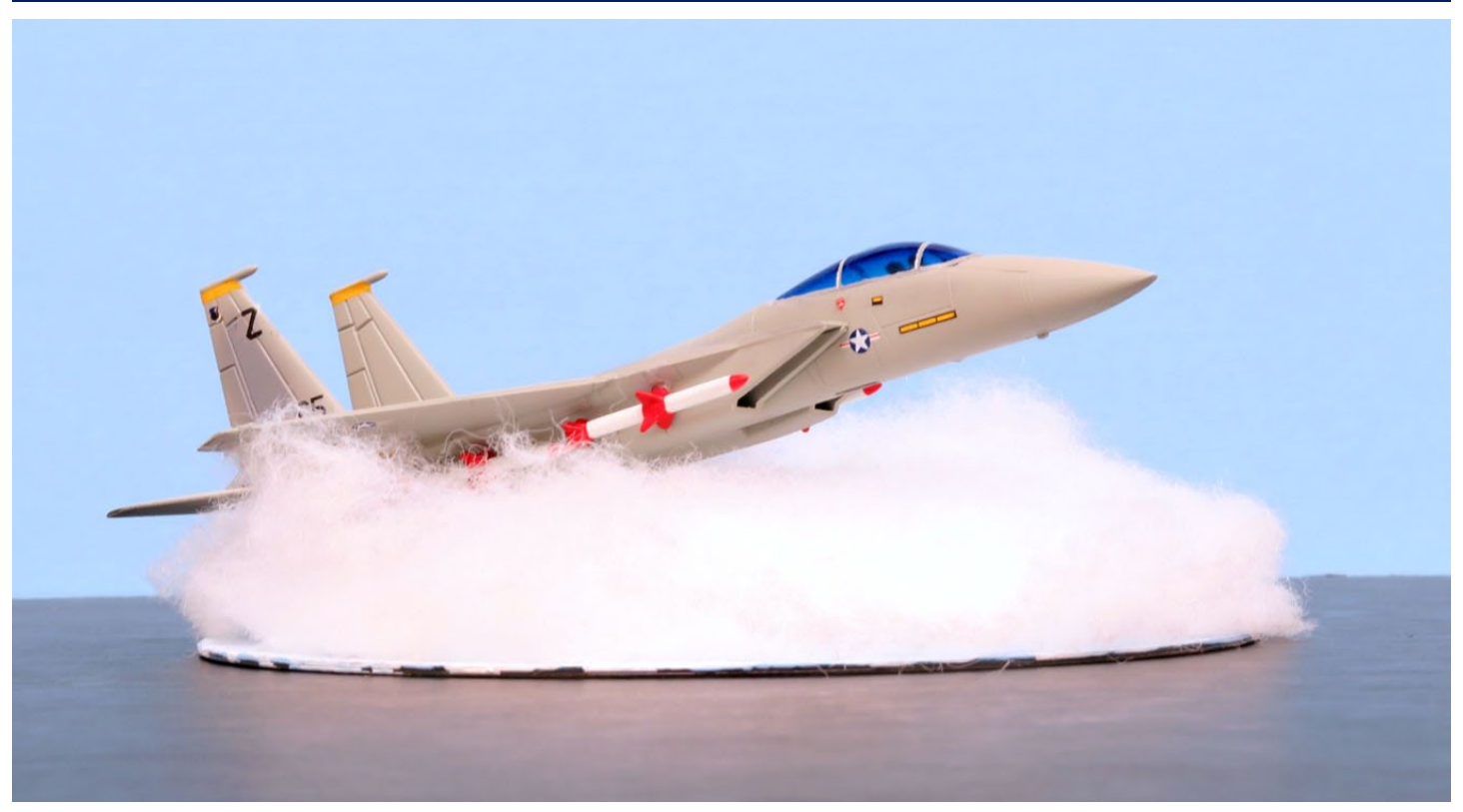
Ken Sullivan's 1:144 scale F-15C Eagle (Academy). Ken scratchbuilt the pilot, seat and instrument panels. Paints are Mr. Paint acrylic lacquers. Ken writes: "This is the same model and cloud base I did last year, but this time I added some interior objects. The kit has no interior, just a flat surface, but it has a clear canopy. So instead of painting the canopy opaque I kept it blue translucent and added interior details painted black to present an outline through the canopy."