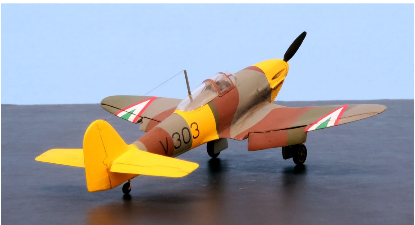
Ora Lassila's 1:72 scale Heinkel He 112 B-1/U2 (Heller). Ora scratchbuilt various details; he also cut out and re-positioned the flaps in extended configuration. Paints are Tamiya acrylics with Testors clear gloss and flat final coats. Weathering was achieved using AV washes and Tamiya's weathering sets. An Aeromaster sheet for the He 112 provided the national insignia, but the plane numbers were the wrong font, so Ora redid them with computer and printer. The model depicts an aircraft of 2/4. Vadászrepülőgép-század (fighter squadron) of the Royal Hungarian Air Force during the Yugoslavian Campaign in April 1941.

The He 112 lost the German RLM fighter competition of 1935-36 to the Messerschmitt Bf 109 and thus was not acquired by the Luftwaffe. Some other countries ordered the plane: Hungary, Japan, Romania and Spain received some. The Finnish Air Force evaluated the He 112 in 1938, but rejected it as expensive and complicated to maintain, opting for the Fokker D.21 instead.