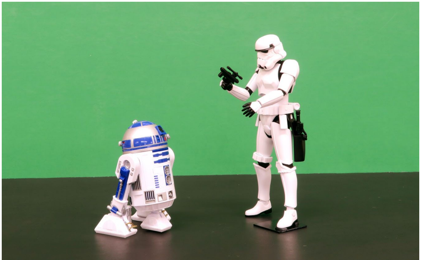
Tom Boisvert's 1:12 scale Star Wars figures, R2D2 and Imperial Storm Trooper (Bandai), built OOB and painted with Tamiya acrylics.